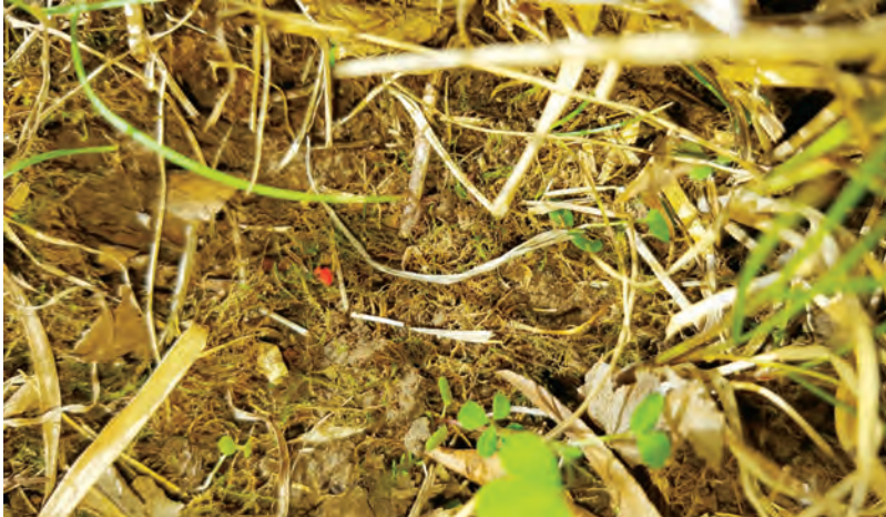
Moss in hayfield with chigger.